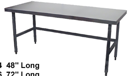
Table Without Back Splash Without Bottom Shelf 34" Tall x 26" Wide